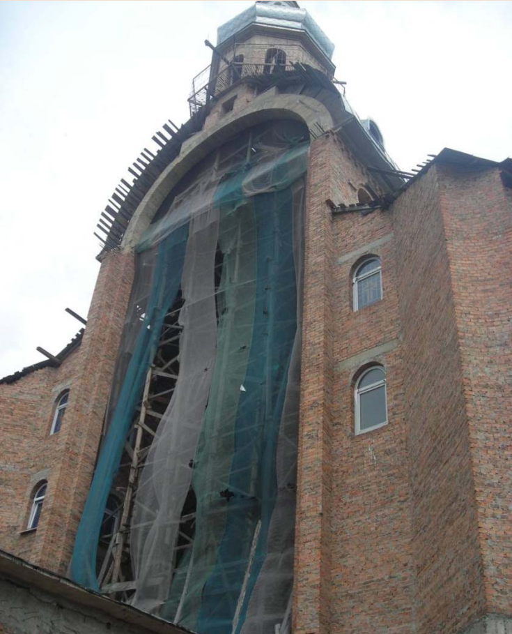
Lutsk parishioners give humble thanks that you have paid for more than one third of their construction costs since 2000.