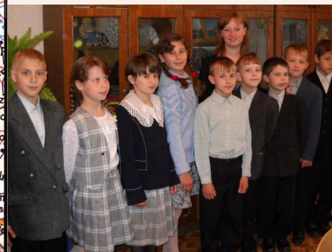
By day we are guest English teachers and by night we are guest missionaries as we pray, sing songs and tuck the orphans into bed at Trypillja orphan boarding school.