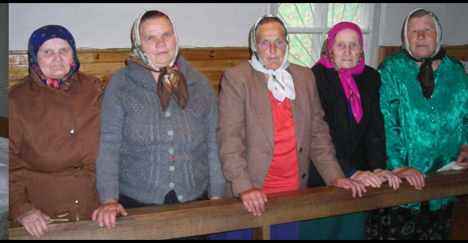
Pious babushkas pray the Rosary in Poteeyivka