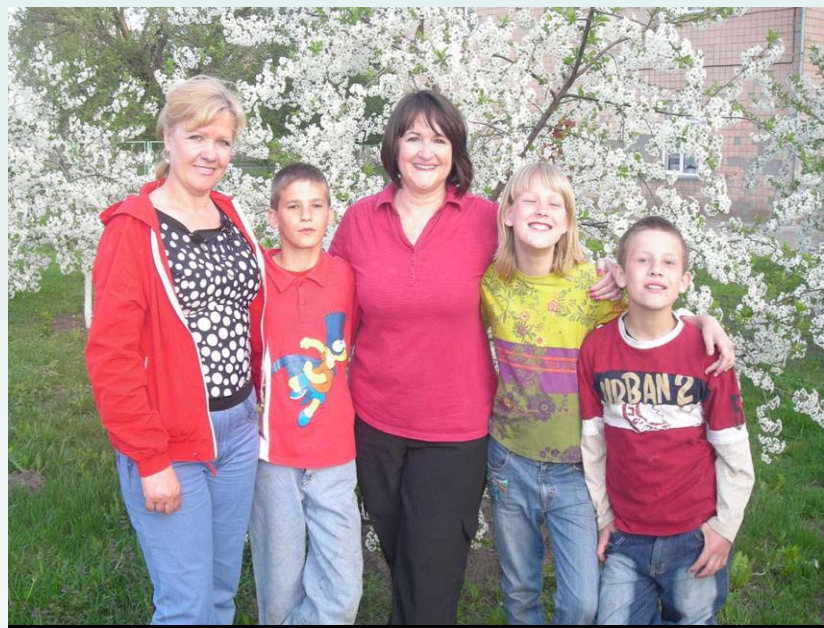
Springtime Cherry blossoms in Trypillja gladden all hearts