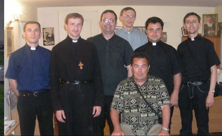
In Odessa with Institute of the Incarnate Word priests