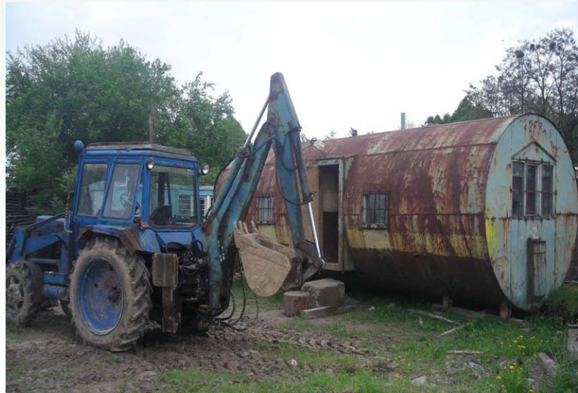
Foreman's office at Lutsk monastery construction site