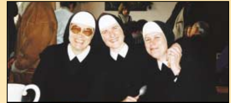
Divine Redeemer Sisters work in Uman

Central to this mission is devotion to Mary's Immaculate Heart , a heart of purity and simplicity