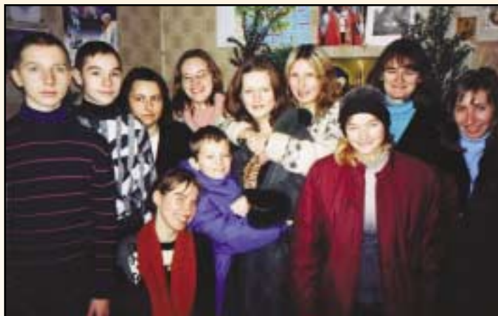
Lutsk Youth group after Divine Liturgy