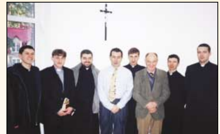
With English class at Vorzel seminary