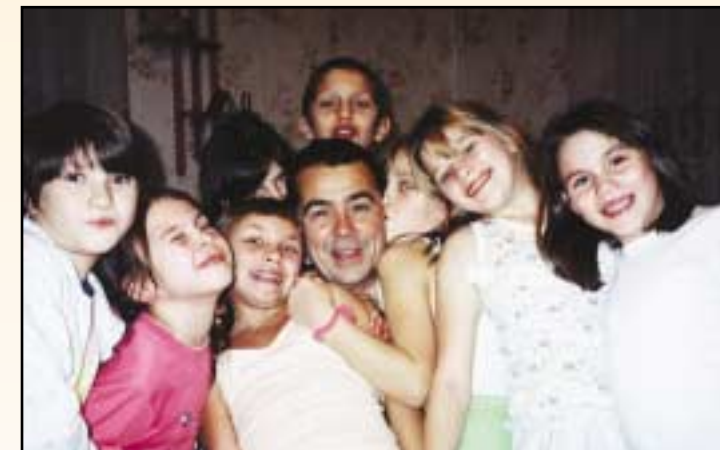
Tripilja orphans of the third grade class