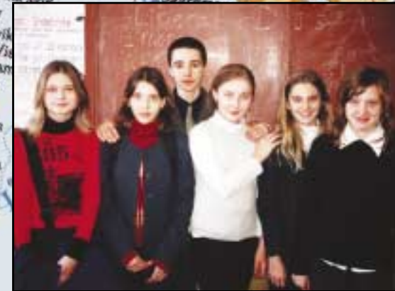
English class at Kyiv Public School #196