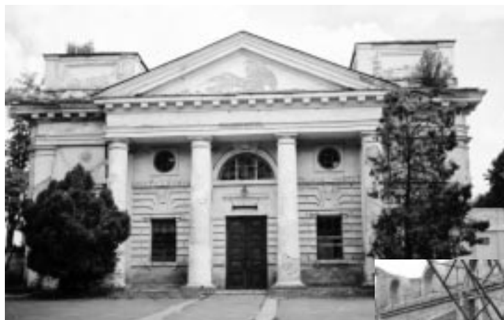
Assumption of Virgin Mary church in Smila needs many repairs.