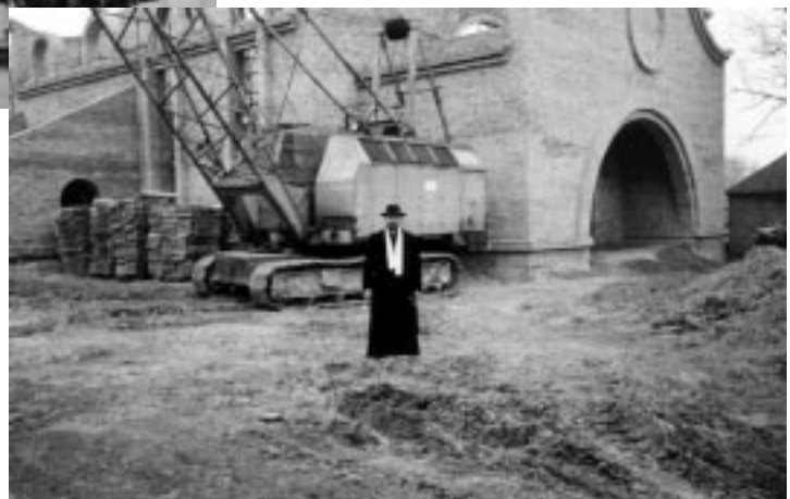
Catholic church under construction in Krivij Rig, Ukraine.