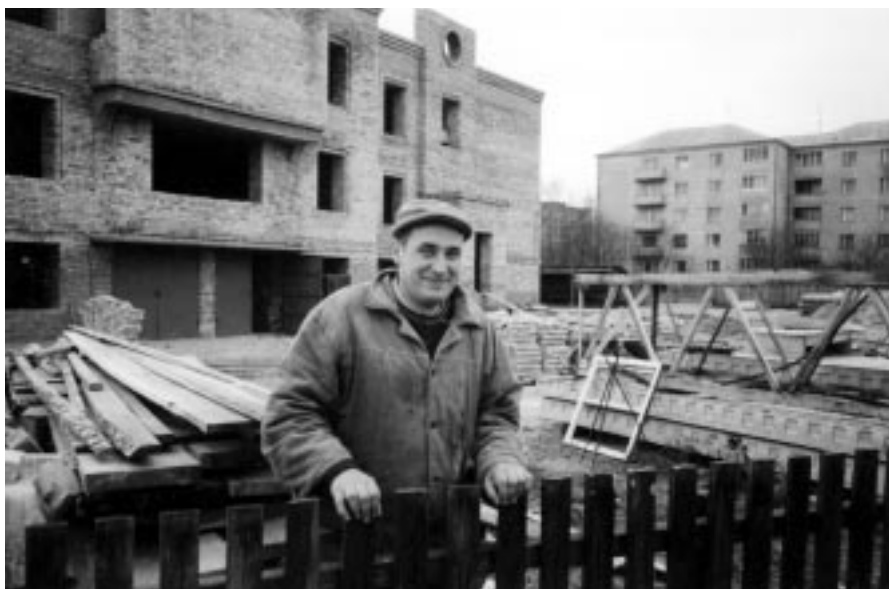
Oblates of Mary building monastery in Obuchiv, Ukraine.

Mary sends us as ambassadors of her heart to bring hope to her sorrowful children. Love is why we look to Russia and Ukraine. We pray the Immaculate Mary to keep us safe, and help us to grow in the virtues of faith, hope, charity, humility, patience, perseverance and obedience, so that we can foster in the hearts of the people an opportunity for conversion and devotion to The Sacred Heart of Jesus and the Immaculate Heart of Mary.