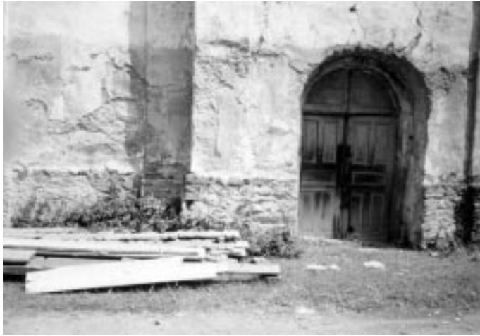
Church in Nyzhniy Bystry in need of restoration.

On Oct.13, 1917 in Fatima, Portugal 70,000 people witnessed the miracle of the sun plunging to the earth, when the vast crowd gasped and begged God's mercy, believing the end of the world was at hand. At Fatima, the Blessed Mother Mary said God the Father in Heaven wishes to establish in this world devotion to her Immaculate Heart. It was also there that she called for the consecration of Russia to her heart and prophesied Russia's eventual conversion. But Russia's conversion without our own would be a great catastrophe.