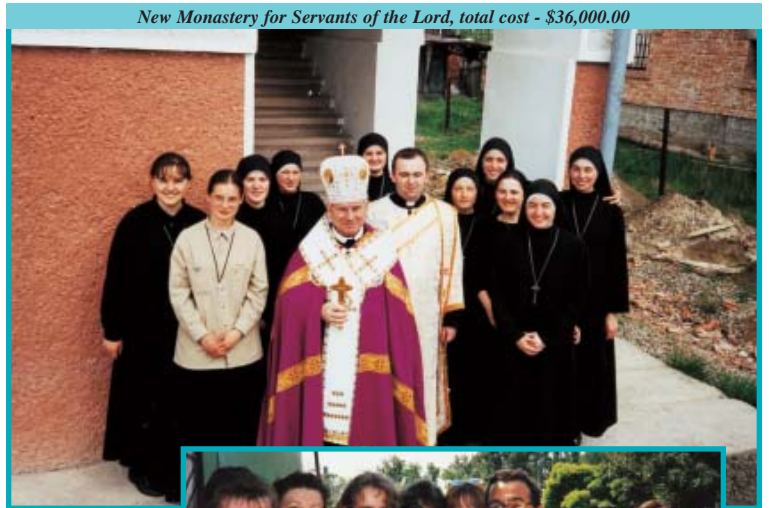
New Monastery for Servants of the Lord, total cost - $36,000.00

Mary is forming her cohort. Those consecrated to her Immaculate Heart she sends into battle armed with their rosaries and scapulars. Her special forces she asks to fast and do battle with the appetites of the flesh. We hope to chain satan in hell for 1,000 years with the fragile cord of the rosary. And we invoke the intercession of our guardian angels, and St. Michael as we head into battle.