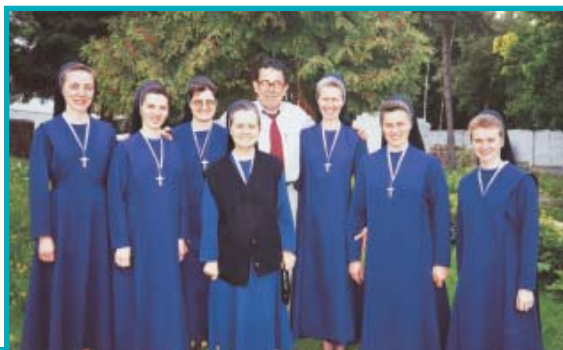
Greek Catholic Sister Servants in L'vov