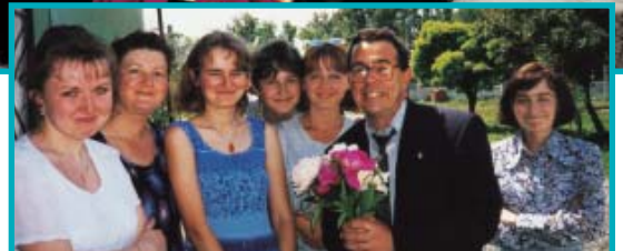
With Lutsk youth group after Divine Liturgy