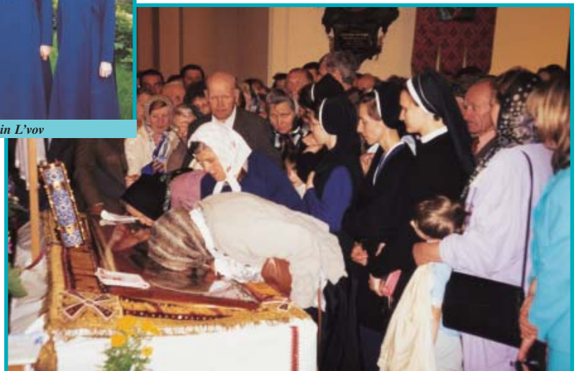
Kissing Jesus' Burial Cloth on Holy Saturday