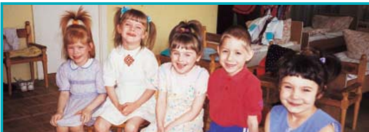
Orphans in L'vov