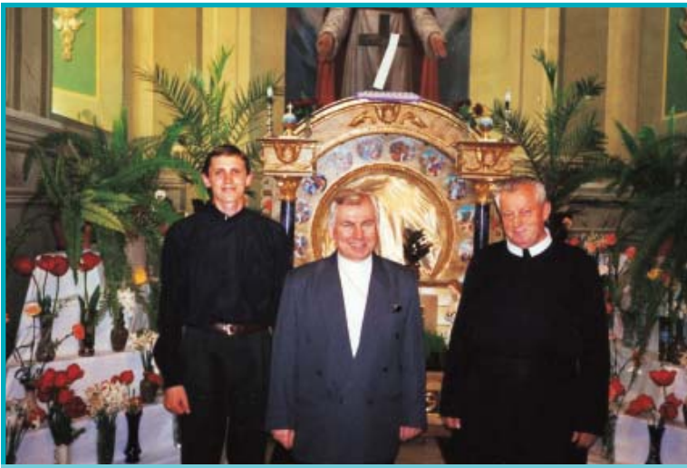
Place of Marian Apparition in Hoshiv, Ukraine