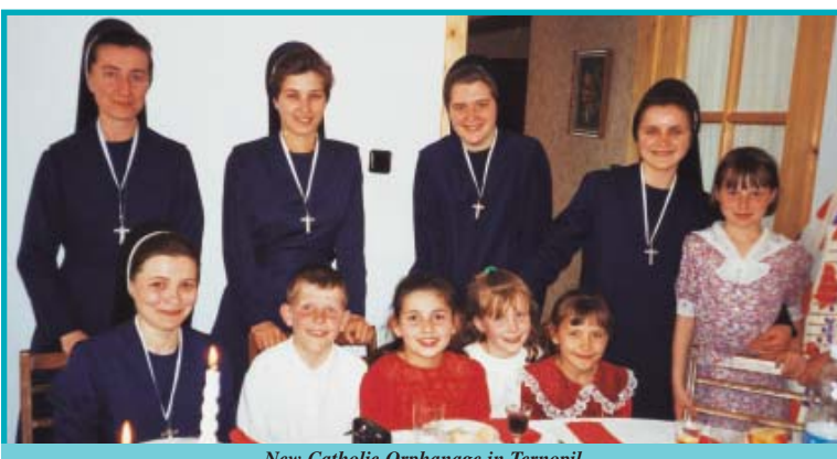
New Catholic Orphanage in Ternopil