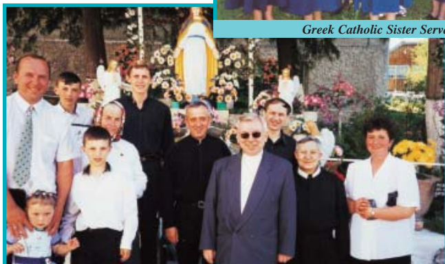
With Pilgrims at Marian Shrine on Easter