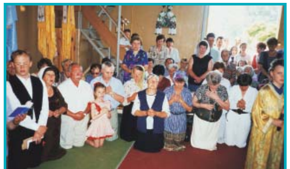
Divine Liturgy at St. Vasyl The Great Church